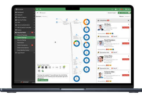
Intuitive easy to use view into the network and endpoint vulnerabilities