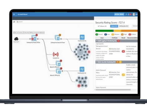
Intuitive view and clear insights into network security posture with FortiManager