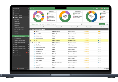
Visibility with FOS Application Signatures